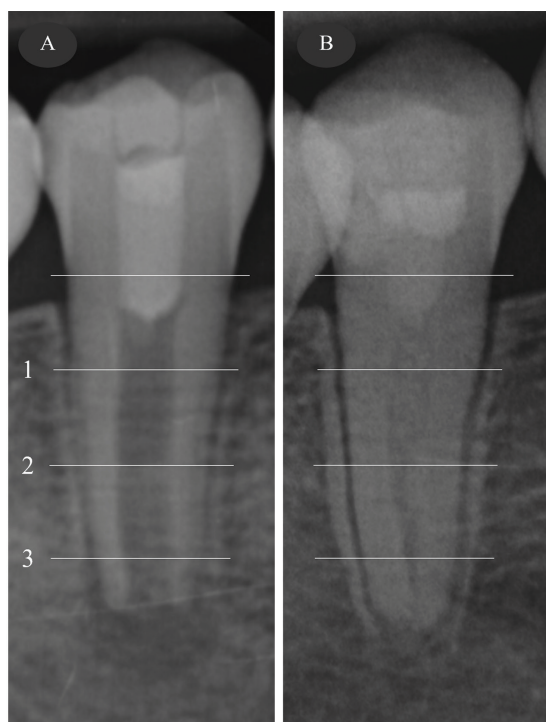
Figure 2: Images showed the three horizontal reference lines for the root and canal width measurements using ImageJ software: (A) a radiograph post-induced bleeding and (B) a 22-month follow-up radiograph. (1=coronal, 2=middle, and 3=apical)

Among multiple factors, persistent microbial infection is considered a primary contributor to the clinical signs and symptoms of apical periodontitis. (19) Thorough disinfection of the root canal system is therefore an essen-