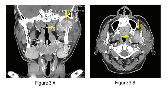
Figure 3: Medical CT images with the soft tissue window mode (3A-3B) show severe condylar bone destruction associated with a large soft tissue mass at the masticator space closed to medial aspect of the left ascending ramus (arrows)