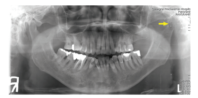
Figure 1: Panoramic image reveals severe bone destruction of the left condyle with an irregular surface and abnormal cortical bone (arrow)

masticator space was taken for biopsy with core ultrasound guided needle biopsy. Microscopic examination revealed large size malignant epithelial cells arranged in thick trabeculae pattern (Figure 5A). The neoplastic cells contained oval or round shape nuclei with occasionally prominent nucleoli and abundant cytoplasm.